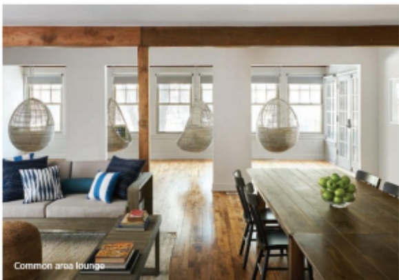
Common area lounge