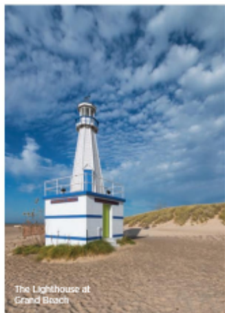
The Lighthouse at Grand Beach

breakfast staples to full dinners, fresh baked pies, wine, beer, bloody Mary, and mimosa kits. And if you happen to be visiting over the weekend, throw in an order of bagels, which are reputed to some of the best of the Midwest (including Chicago).