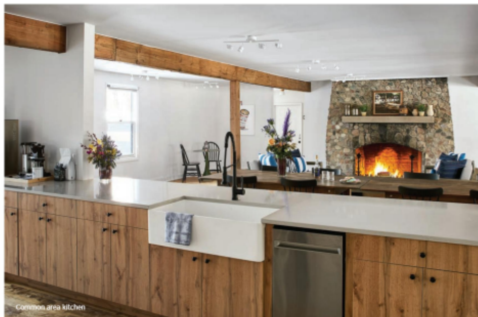
Common area kitchen

S OME CALL NEW BUFFALO and other lakeside towns in Harbor Country, Michigan the North Shore, west. Those with beach houses and cottages there can attest to the likelihood of running into Lake Forest or Lake Bluff neighbors while grabbing a burger at Redamak's or another hotspot around town.