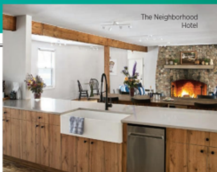
The Neighborhood Hotel